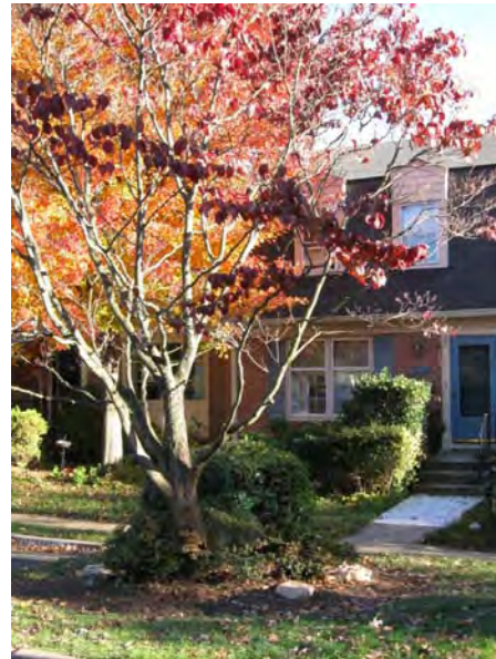
Dead trees removed from parking area on Evelyn Ct.

Now that summer is here, Cheri is planning new projects to continue the beautification efforts. Please consider contacting Cheri to help. Together, we can significantly improve the look of our homes!